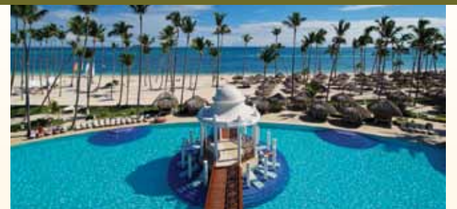
Six Star presidents and managers for 2014 will earn a trip to Paradisus Palma Real Resort in Punta Cana.

Local company presidents and managers and their employees benefit. Six Star presidents and managers for 2014 will earn a trip in April 2015 to the Paradisus Palma Real Resort in Punta Cana, Dominican Republic. Employees can receive credits and select from almost 10,000 merchandise rewards.