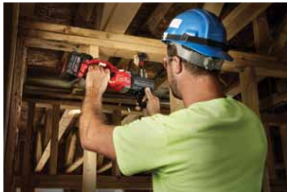
Milwaukee's new M18 FUEL™ Hole Hawk® Right Angle Drill for electrical contractors will be available Oct. 1.