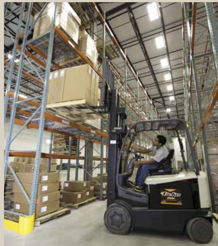
Available on the Win Learning Center are 127 new safety courses, including some on forklift best-operating practices. Gideon Yilma uses a forklift to place product on a rack at the Middletown regional distribution center in Connecticut.

WinWholesale believes taking the safety courses is important enough that training records may be subject to verification through internal audits, said Greg Holbrock , WinWholesale Internal Audit manager. Records