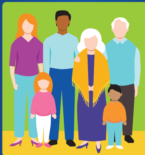
Families who want multigenerational living