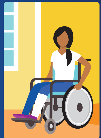
Individuals with physical limitations or disabilities