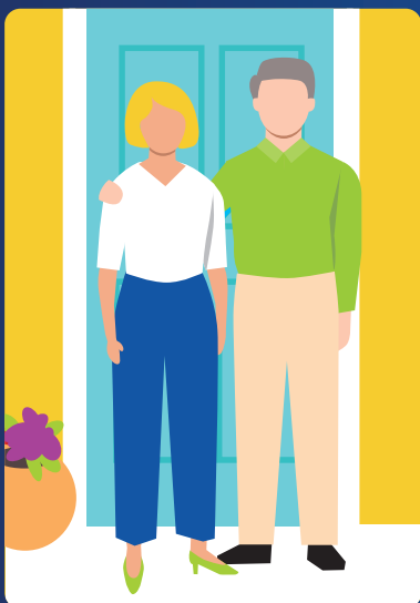
People who want to live in place as they age